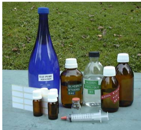
Fig 1: inventory picture of necessary equipment